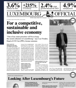
LuxembourgOfficial: Our freemium publication