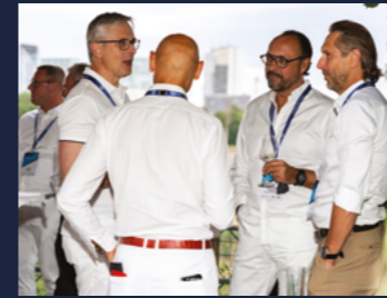
CEO White night