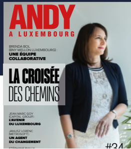
Andy: Business magazine in French