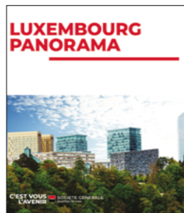
Brochure: Produced together in 3 hours