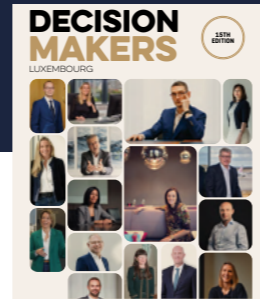
Decision Makers: The annual Luxembourg business directory