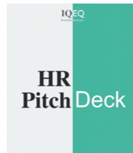
Pitch deck: 10 slides in 3 hours