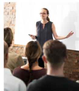
Consulting: 50 modules delivered in 3 hours