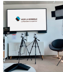
Studio in your company: from 35€/day