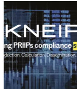
Corporate Videos: For companies of all sizes