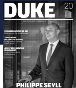
Duke: Business magazine in English