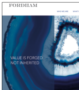
Websites: Simple website in 1 day